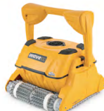
362128 WAVE 100 ROBOTIC POOL CLEANER