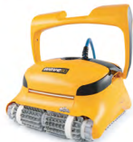
362127 WAVE 80 ROBOTIC POOL CLEANER