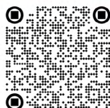
SCAN FOR PRODUCT INFO