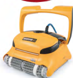
362126 WAVE 60 ROBOTIC POOL CLEANER