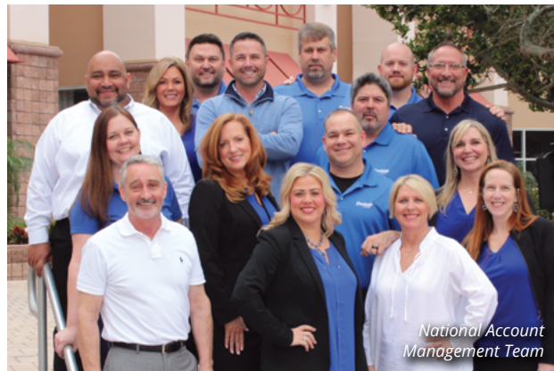
National Account Management Team